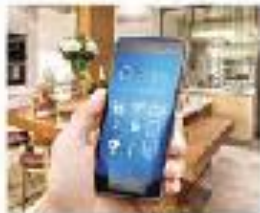
Lighting & Shade Controls

Authorized dealer for top brands including Brilliant • Denon/HEOS LG • Lutron • Merantz Merlin Logan • RTI • Samsung • Sonos • Sony SpectraLink • URC