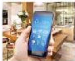
Lighting & Shade Controls

Brilliant • Denon/HEOS LG • Lutron • Marantz Martin Logan • RTI • Samsung • Sonos • Sony Speakercraft • URC