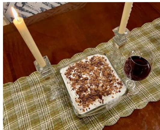
Jill Caron: Toffee Twinkie Cake with Twinkies, Heath bars, vanilla pudding & Cool Whip.