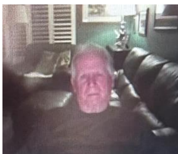
Arnie... not sure what it was, but clearly it was satisfying!