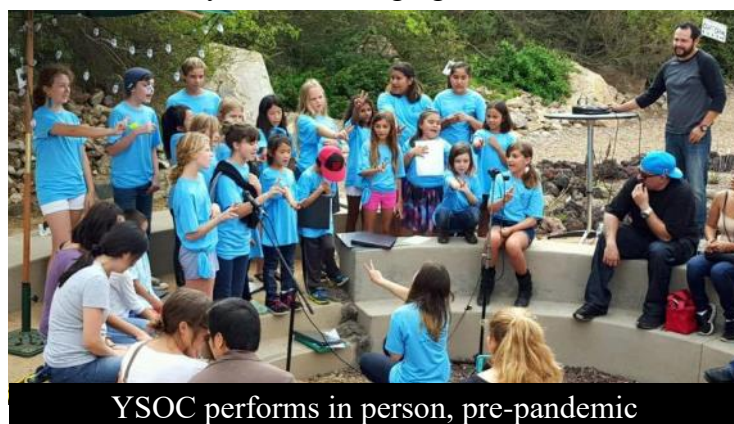
YSOC performs in person, pre-pandemic

The youngsters missed the warm camaraderie of in-person rehearsals, and making zoom meetings effective, fun, and engaging was not easy, but their success can be measured by the growth from just a couple of kids to around a dozen.