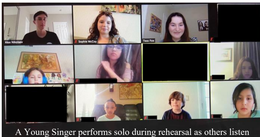
A Young Singer performs solo during rehearsal as others listen

How does a children's choir work when nobody can be together?