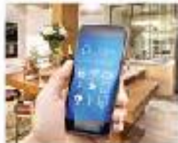
Lighting & Shade Controls

Brilliant • Denon/HEOS LG • Lutron • Marantz Martin Logan • RTI • Samsung • Sonos • Sony Speakercraft • URC