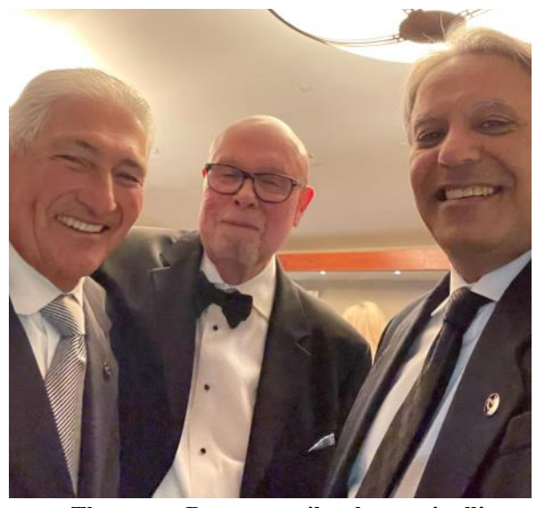
Three true Roosters smiles that say it all!