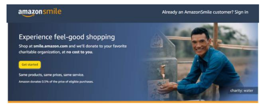
Have you heard about Amazon Smile?

I don't know about you but I am fairly addicted to purchasing things from Amazon!