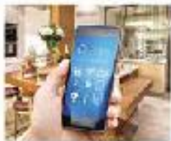
Lighting & Shade Controls

Authorized dealer for top brands including Brilliant • Demon/HEOS LG • Lutron • Marantz Merlin Logan • RTI • Samsung • Sonos • Sony SpectraLink • URC