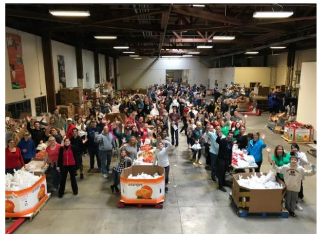
Memories of past good times - our winter Food Drive. Hopefully this will become a reality again soon!