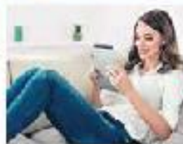
Networking & Wi-Fi