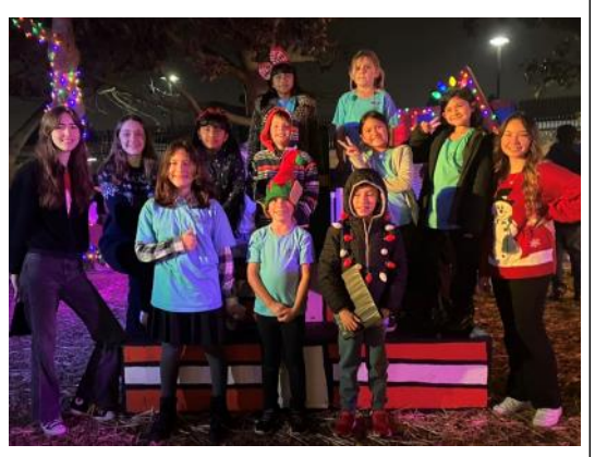
Young Singers of Orange County before and during their performance at Costa Mesa's Snoopy House in December