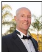
Dan Stone Food Program