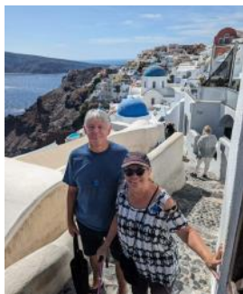
...and in Santorini.