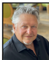
Bleu Cotton Speakers Chair